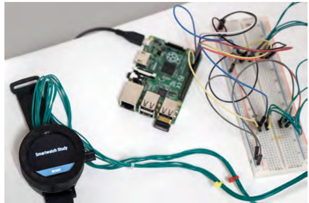
Figure 1. Smartwatch prototype consisting of our 3D-printed housing including the mechanical components for the digital crown and the rotatable bezel, a Moto 360 and the attached Raspberry Pi B+.

http://dx.doi.org/10.1145/3098279.3098542